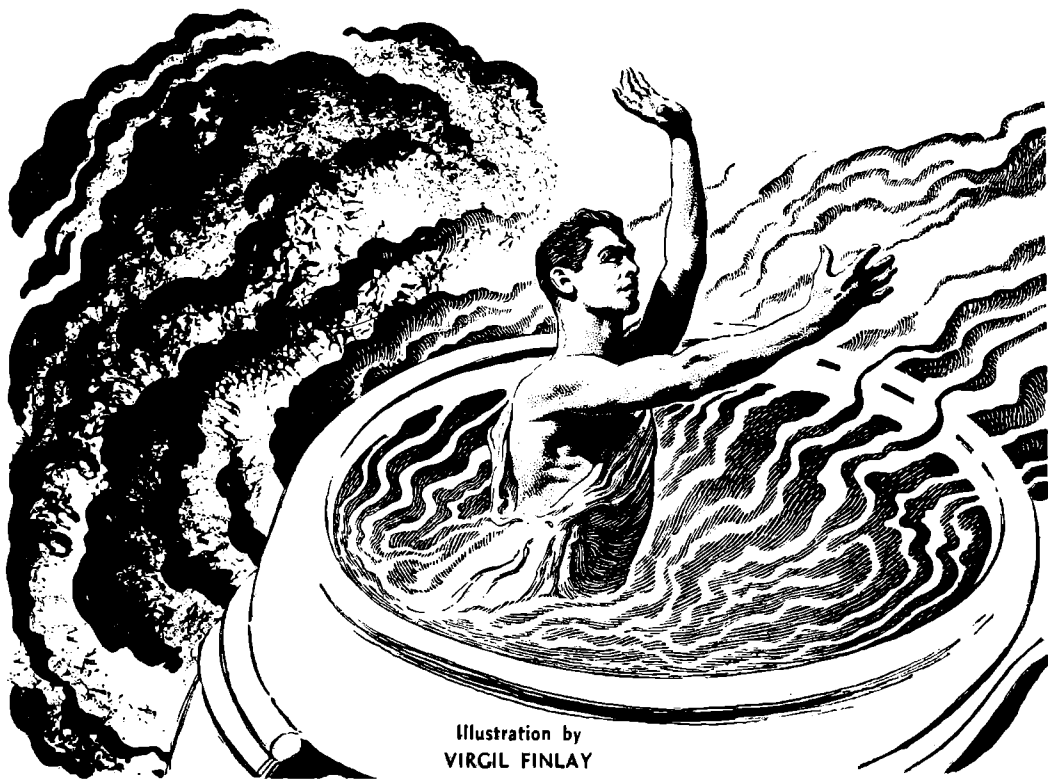
Illustration by VIRGIL FINLAY

B UT what is reality?" asked the gnomelike man. He gestured at the tall banks of buildings that loomed around Central Park, with their countless windows glowing like the cave fires of a city of Cro-Magnon people. "All is dream, all is illusion; I am your vision, as you are mine."